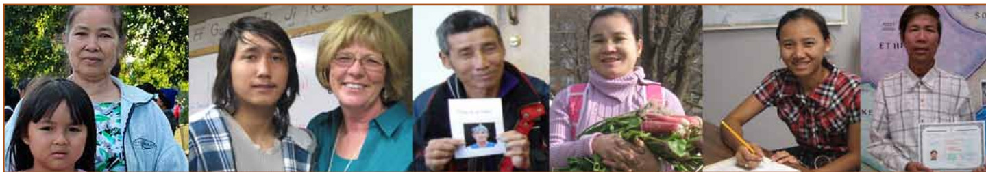
The faces of International Learning Center...

ESL • Citizenship • Math • Computer Skills • Pre-school • Life Skills • Tutoring